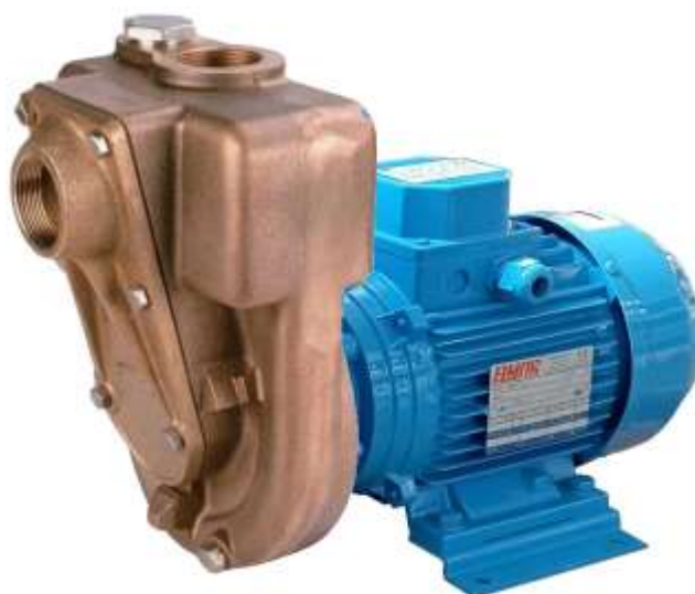
Immagine dimostrativa / Demonstrative image